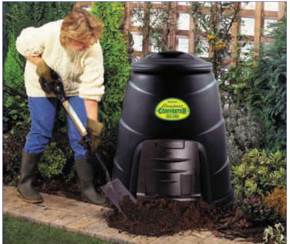
Over 7,000 composters have been sold to date - have you got yours?