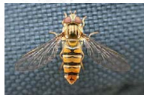
▲ Adult hoverfly

▲ The identity of a bee, wasp, hornet and honey bee